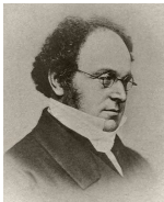
Augustus De Morgan